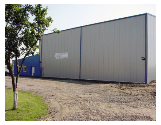
Fig. 1. Office complex with attached building for hydrotechnics system.

capacity of 100 m<sup>3</sup> each, a three-line filter system with a treatment capacity of up to 65 m<sup>3</sup>/h each and two stainless-steel pure water tanks with a capacity of 570 m<sup>3</sup> each.