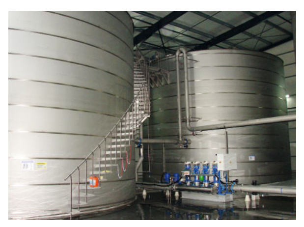
Fig. 3. Tank system with pressure booster system for pure water supply. \ensuremath{{\mbox{\tiny B}}} Hydro-Elektrik GmbH

and especially not with such a short building period.