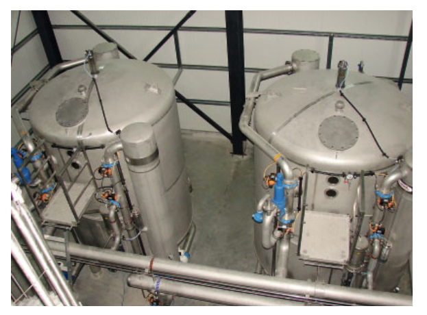
Fig. 2. Compact drinking water plants.