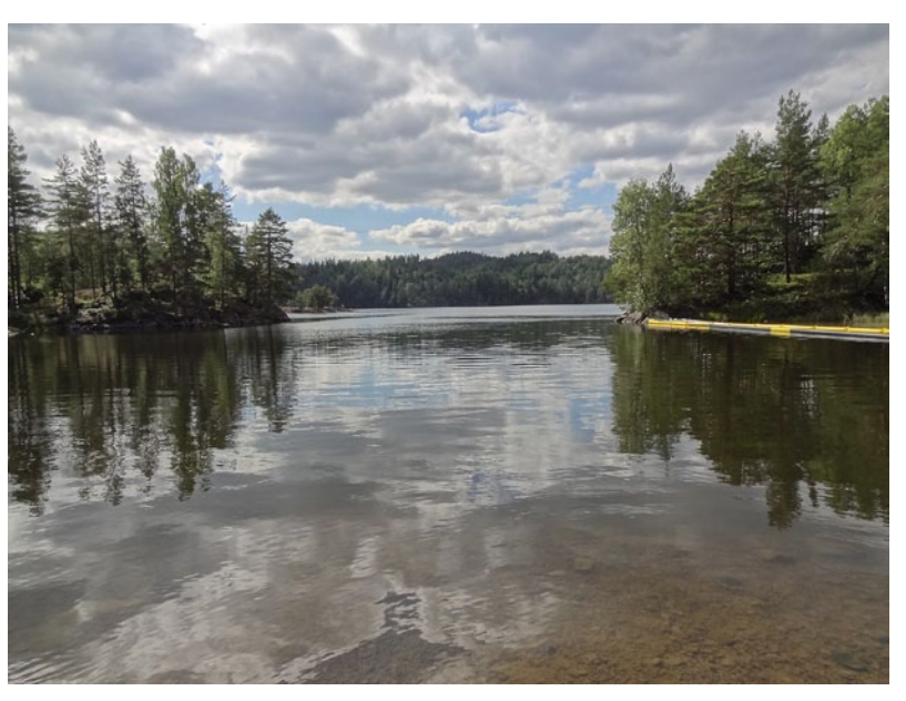
Figure 1. Raw water source inland lake "Flåte".

variants. A system entirely made of stainless steel components has turned out to be the most advantageous solution. The system of two treatment lines comprises two horizontal ozone reaction tanks, two upstream filters with filter vessels made of stainless steel for hardening, two downstream filters with filter vessels made of stainless steel for bio-filtration and a pure water tank also made of stainless steel. The primary reasons for deciding in favour of stainless steel included the distinctly shorter construction periods, the easily achievable high standards of design and safety at the calculated building costs. The latter is crucial, because the building structure can be completed during the summer months and the on-site production of the tanks and filters can be completed inside the building during the severe Norwegian winter.